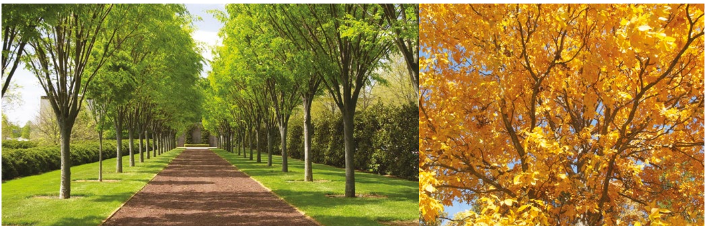
Above —The Milliken Arboretum on the site of the Roger Milliken Center, Milliken's Corporate Headquarters in South Carolina, USA.